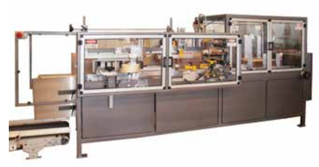
Eagle Packaging Machinery's Boxxer case erector.

production, but as volume continued to increase, they decided the time was right for a capital investment in automated equipment to meet customer demands. Finding a turn-key solution wasn't an option as the machine needed to be able to handle the quality and size variations of the boxes, while maintaining a good production speed.